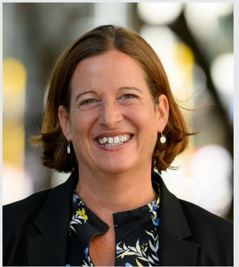
Ms Ruth Shinoda

Te Tumu Whakarae mō Te Tari o te Pirimia me te Komiti Matua Secretary of the Department of the Prime Minister and Cabinet Te Tari o te Pirimia me te Komiti Matua | Department of the Prime Minister and Cabinet Commenced April 2024