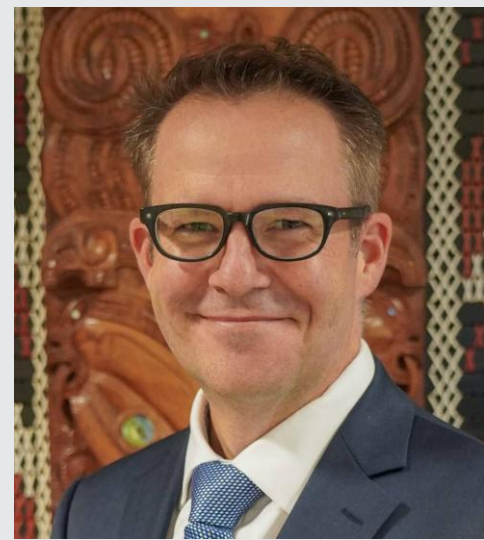
Mr Ben King

Te Tumu Whakarae mō te Taiwhenua Secretary for Internal Affairs Te Tari Taiwhenua | Department of Internal Affairs Commenced October 2018